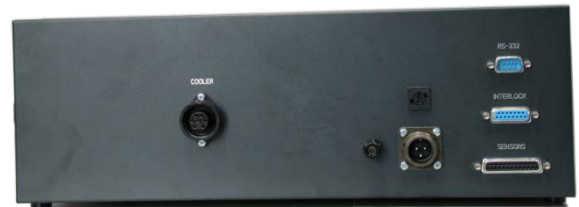
BlueLas Controller BSC1000